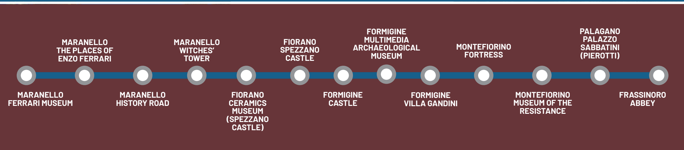
Montefiorino: the Museum of Resistance