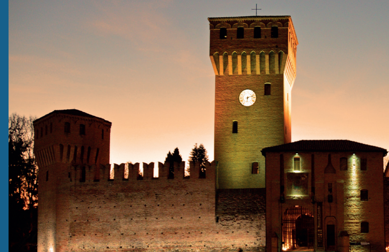
Formigine: the Castle

Parco di Villa Gandini, Formigine +39 059 416246