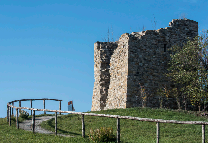
Maranello: the Witches' Tower