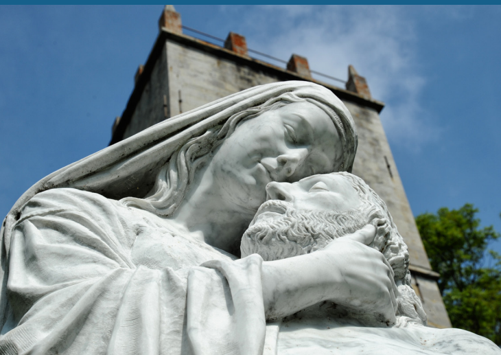
Frassinoro: "Pietà" sculpture by Dario Tazzioli near the Abbey