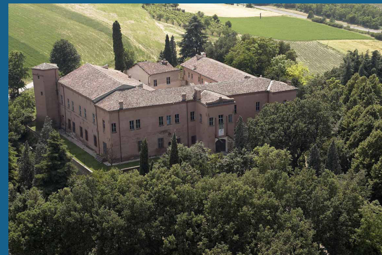
Fiorano Modenese: Spezzano Castle