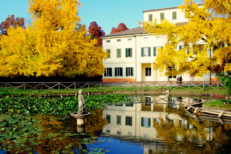
Formigine: Villa Gandini