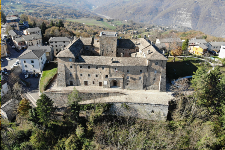
Montefiorino: the Fortress